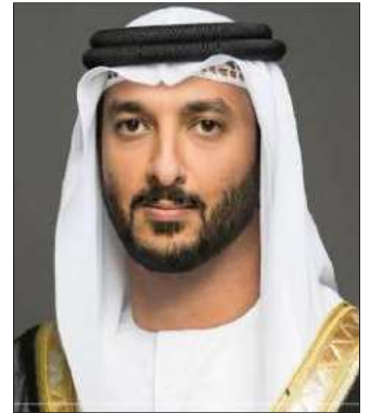
H.E. ABDULLAH BIN TOUQ AL MARRI

With the UAE's non-oil sector accounting for 74% of national gross domestic product (GDP) in 2024, H.E. Al Marri reaffirmed the Ministry of Economy's ambitious plans for the years ahead, insisting, said, "We are in the business of breaking records. We've already achieved a non-oil sector that accounts for 74% of GDP – this record has never happened before in our country's history. The UAE's environment and ecosystem attracts